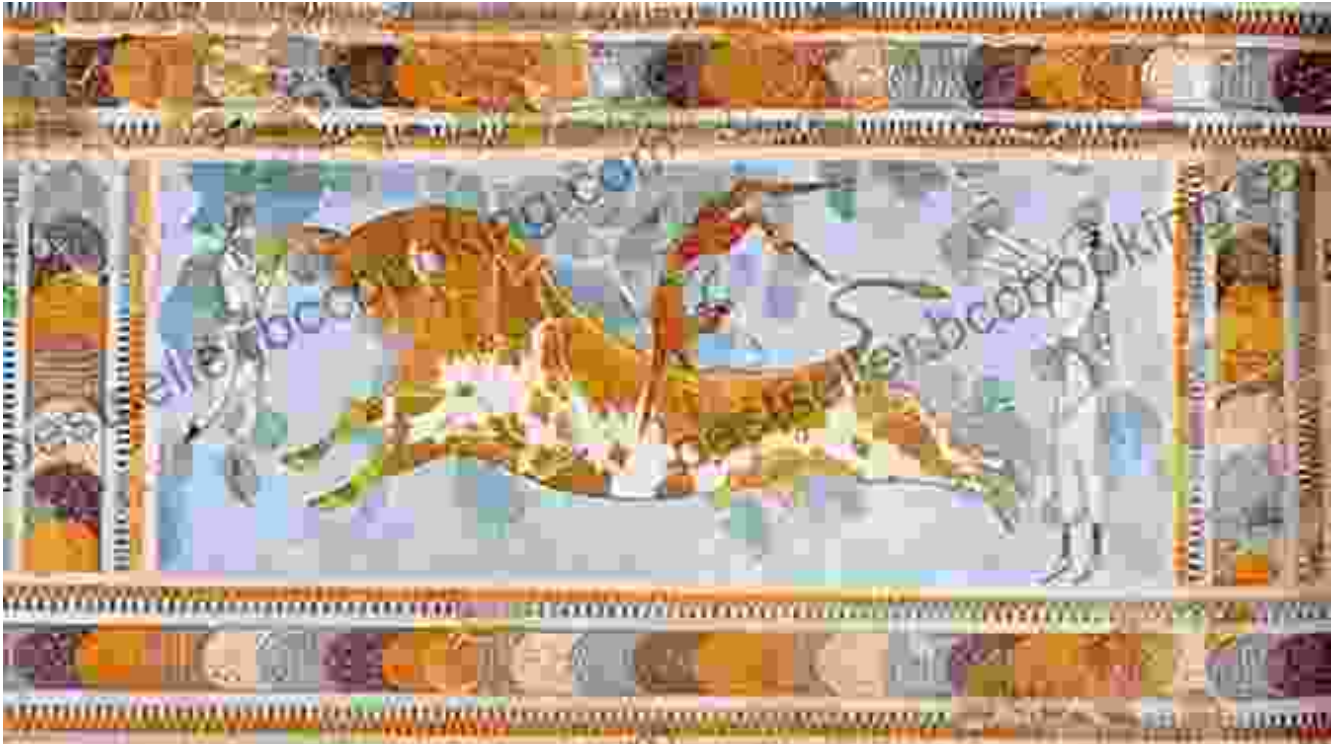
Minoan fresco from the Palace of Knossos, c. 1500-1450 BCE