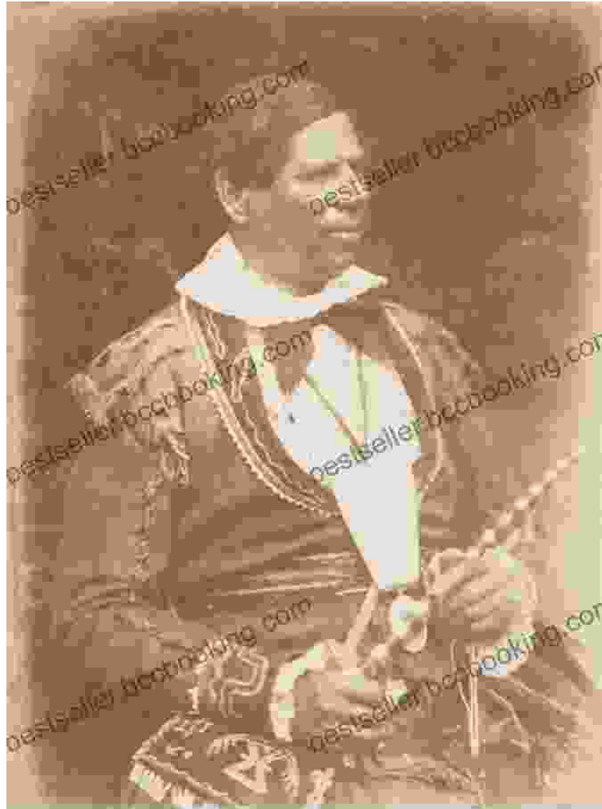
Rev. Peter Jones or Kahkewaquonaby, 1802 - 1856, Indian chief and missionary in Canada (c. 1843), oil on canvas